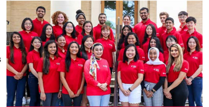
International Student Life’s 2019 World Leaders