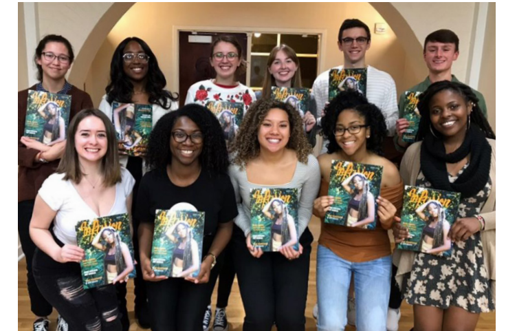
InfUSion Magazine editors and contributors celebrate their latest issue.

To learn more about InfUSion Magazine, visit infusionmagazine.com