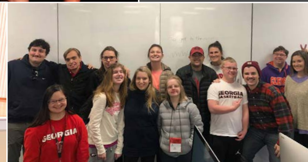
Above: Destination Dawgs members and mentors pose in a classroom to kick off the new semester.