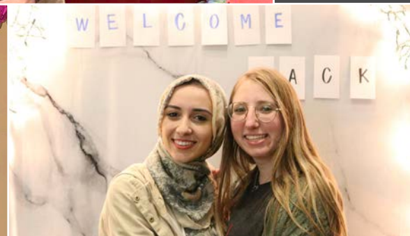
Above: The Pakistani Student Association hosts a winter potluck to kick off the new semester.