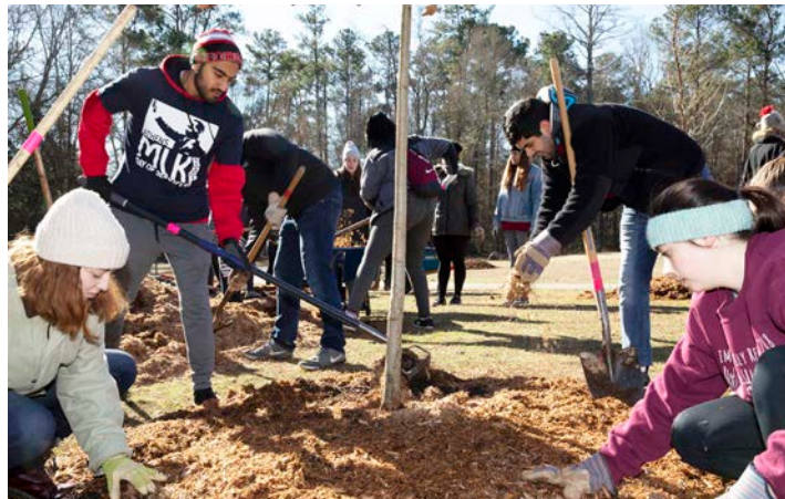
UGA students work with other volunteers from the Athens-Clarke County community to plant oak trees at Winterville Elementary School during the 2019 MLK Day of Service.