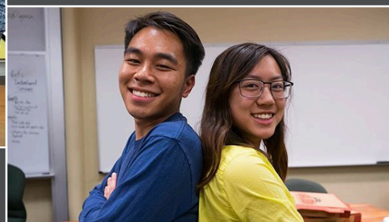
Below: The Vietnamese Student Association welcomed new board members.