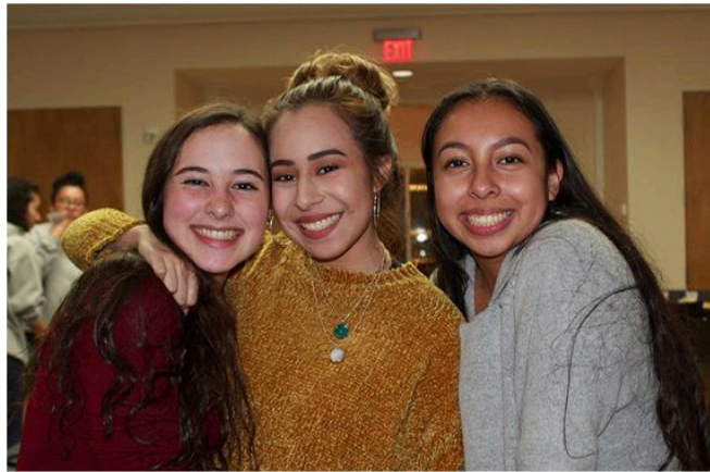
Above: Members of the Hispanic Student Association gather for a social event.