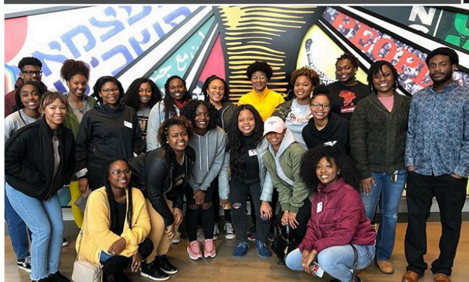
Above: The Black Educational Support Team (BEST) traveled to the National Center for Civil and Human Rights to honor Black History Month.