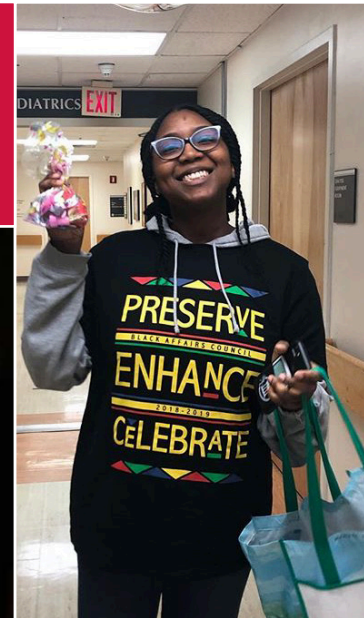
Above: A student from the Caribbean Student Association delivers candy grams on Valentine's Day at a local hospital.