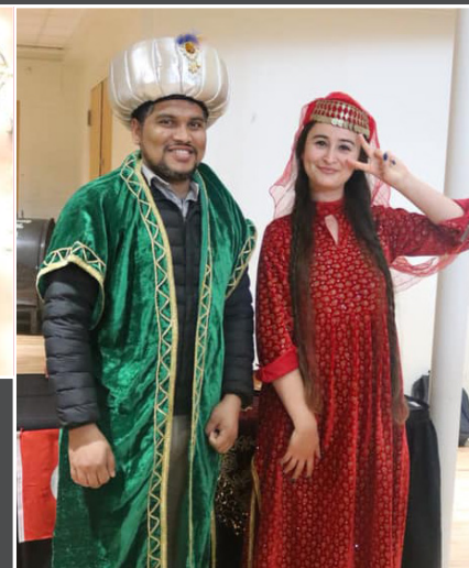
Right: Members of the Turkish Student Association host an international coffee hour.