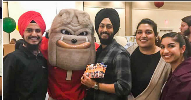
Below: Students from the Sikh Student Association pose with Hairy Dawg during the Involvement Fair.