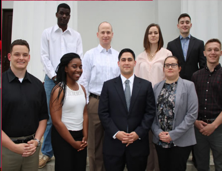
Right: Members of the Student Veterans Association. UGA was recently named the top institution in the nation for service to student veterans.