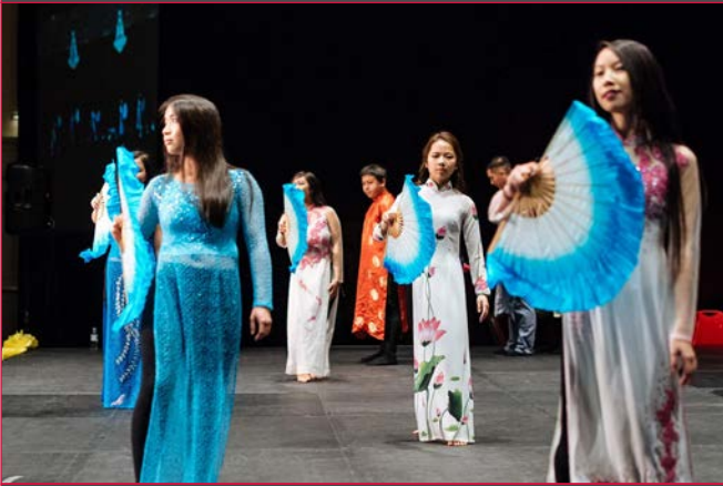
Above: Students perform in the Vietnamese Student Association's Night in Saigon, an annual event that promotes and shares Vietnamese culture and heritage.