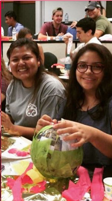
Above: Students participate in the Hispanic Student Association's DIY Piñata Night.