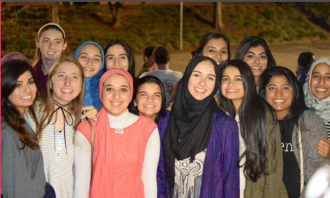
Above: Members of the Muslim Student Association and Catholic Student Association host a joint bonfire.