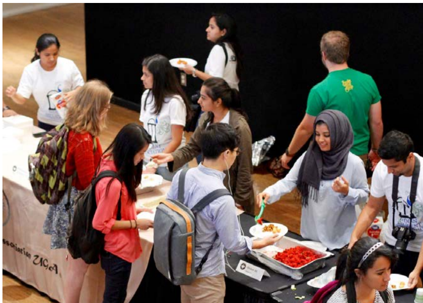
Members of the Pakistani Student Association serve food to fellow students during an International Coffee Hour event.

Spring 2017 International Coffee Hour hosts have included the Caribbean Student Association, Turkish Student Organization, LGBT Resource Center, African Student Union, Brazilian Student Union, Amnesty International, Thai Student Association, Nepalese Student Association, Persian Student Union, Muslim Student Association and Asian-American Student Association.