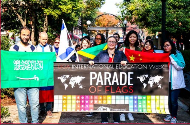
Above: International students participate in a parade of flags during International Education Week.