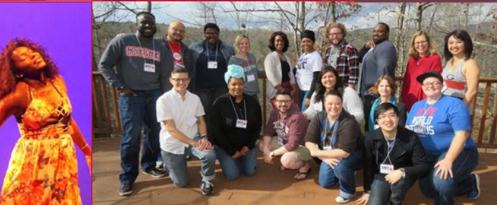
Above: Students from all backgrounds explore social justice issues during the IGNITE winter retreat.