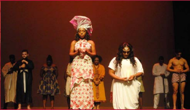
Above: Members of the African Student Union perform at Africa Night, an annual event celebrating African culture.