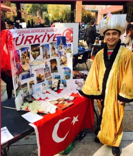
Right: The Turkish Student Association table at WorldFest.