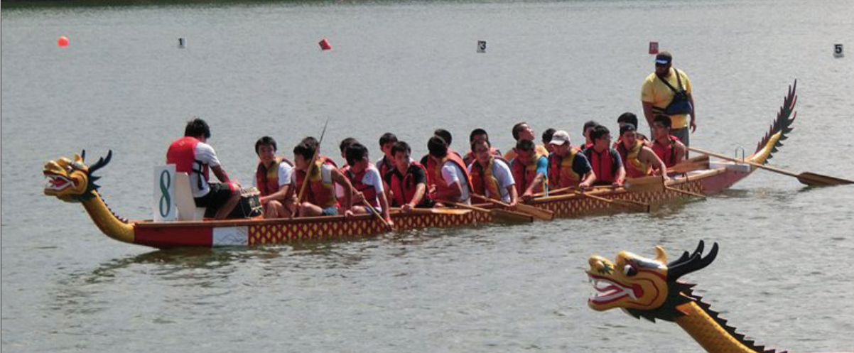
Below: Members of the Col