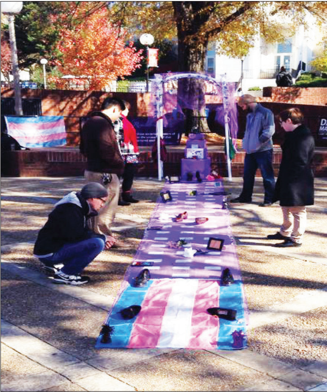
Above: Students reflect on a LGBT Resource Center display at the Tate Center on Transgender Day of Remembrance 2014.