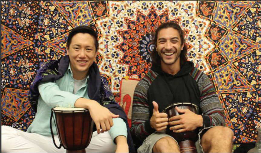
Left: Students participate in a meet and greet for Latinos Invested in the Students of Tomorrow (LISTo).

UGA GLOBES http://ugaglobes.wordpress.com/