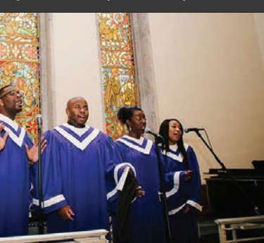
Chinese Undergraduate Student at the 2014 Dragon Boat Festival. Georgetown Gospel Choir perform.