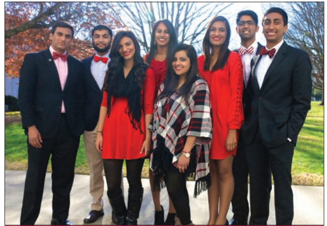
Emcees from India Night meet on North Campus before the annual spring celebration.

Learn more about the Indian Cultural Exchange at www.ugaice.org