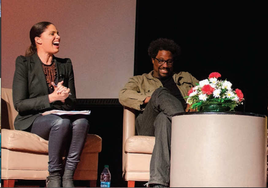
Left: Members of the UGA C Association participate in the