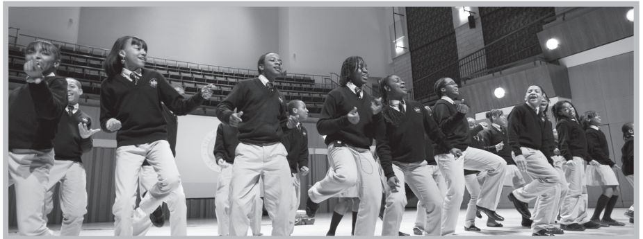
Students from the Ron Clark Academy perform during the Holmes-Hunter lecture.