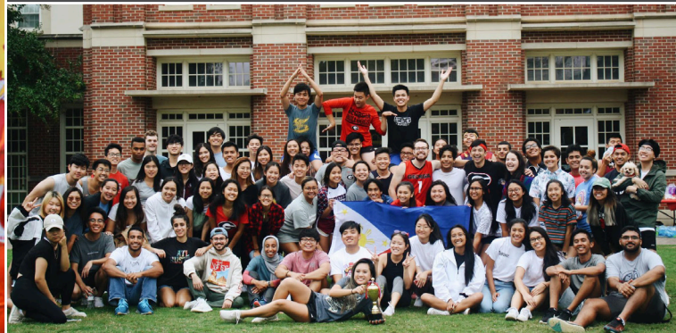
Below: Students come together in a multicultural field day hosted by the Filipino Student Association, Arab Cultural Association, Korean Undergraduate Student Association and Vietnamese Student Association.