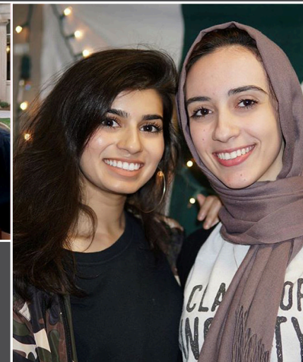
Right: The Pakistani Student Association kicks off the semester with a general body meeting.