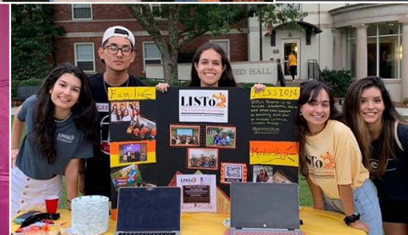
Above: Members of Latino/as Invested in the Students of Tomorrow (LISTo) host an informational barbecue.