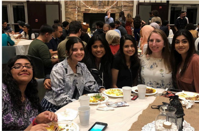
Above: The Arab Cultural Association hosts a banquet to celebrate Eid al-Adha.