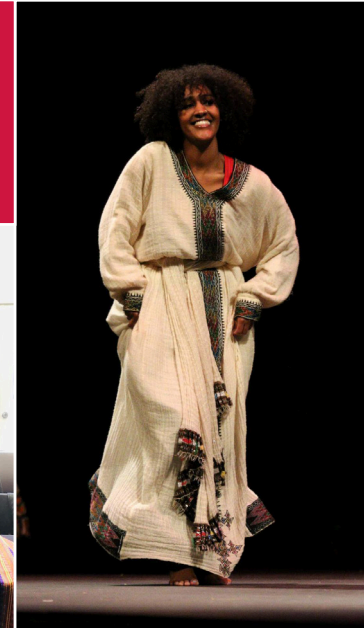
Above: A member of the African Student Union performs a dance at the annual Africa Night.