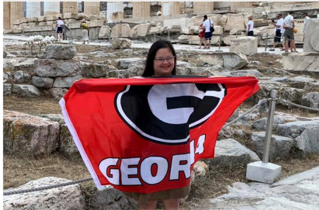
Above: A member of the UGA Destination Dawgs poses with a Georgia flag in Athens, Greece.