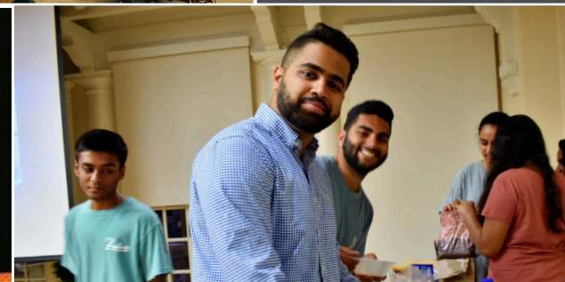
Above: The UGA Indian Cultural Exchange hosts their first Chai and Chaat of the semester.