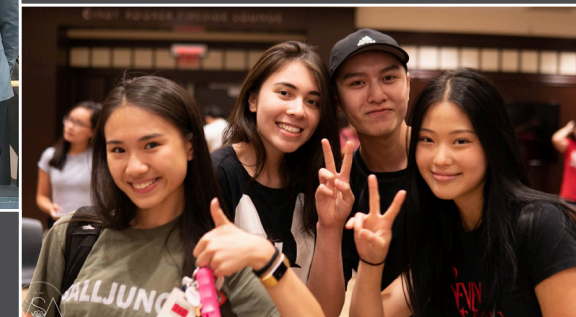
Below: The Vietnamese Student Association hosts its first general body meeting of the semester.