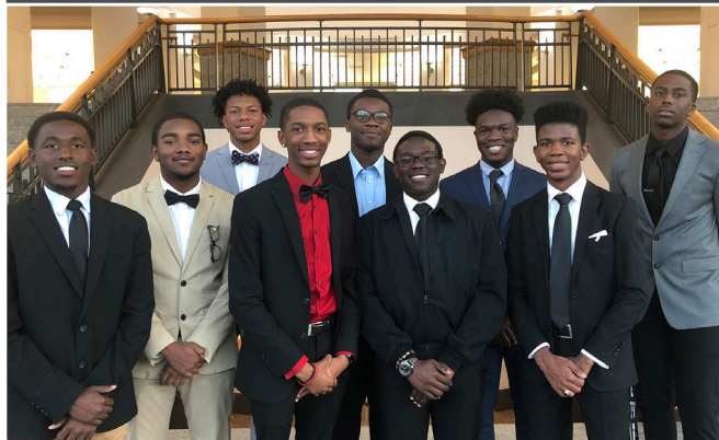
Above: The UGA Black Male Leadership Society welcomes their 2019 Freshman Council.