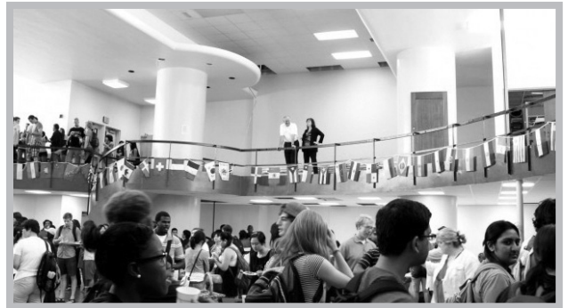
International Coffee Hour regularly attracts 300 students, faculty, staff and community members.