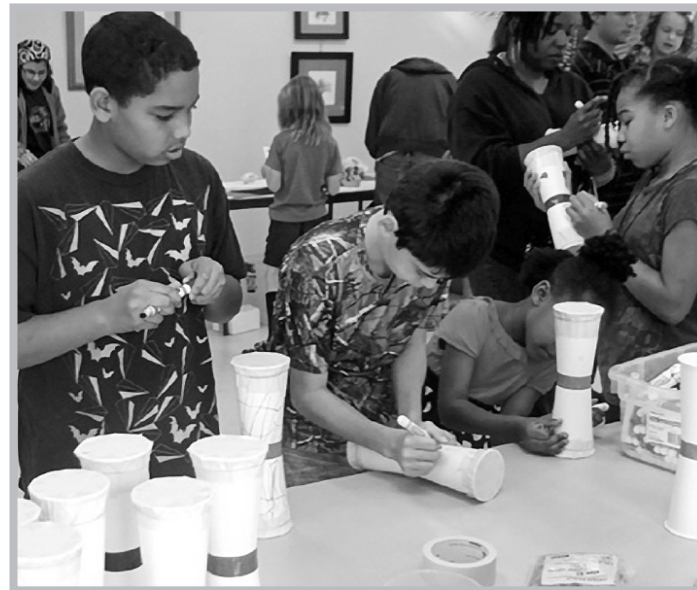
Children decorate drums at Africa Family Day at the State Botanical Garden. The event was part of the 25 th anniversary celebration of African studies at UGA.

Students were an especially big presence at some of these events. As a class assignment, students in African language courses led a cultural awareness event on Nov. 15 where