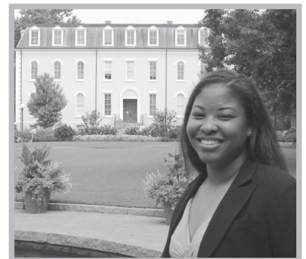
Holland in front of Moore College

For more information on CURO, see www.uga.edu/honors/curo . ■