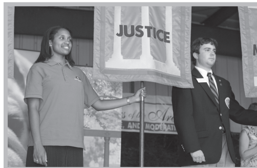
Student leaders display the "Pillars of the Arch"—wisdom, justice and moderation—at Convocation.

Just over 400 freshmen are enrolled in UGA's nationally recognized Honors Program. Their average high school GPA of 4.11 and average SAT of 1446 are the highest in Honors Program history. ■